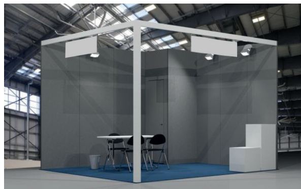
ST132 - CORNER BOOTH (TWO OPEN SIDES)

Graphics may only be attached to walls using drawing pins or headless tacks. Graphics cannot be applied to frontal sign and pillars.