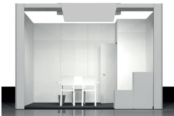
ST086 - LINEAR BOOTH (ONE OPEN SIDE)